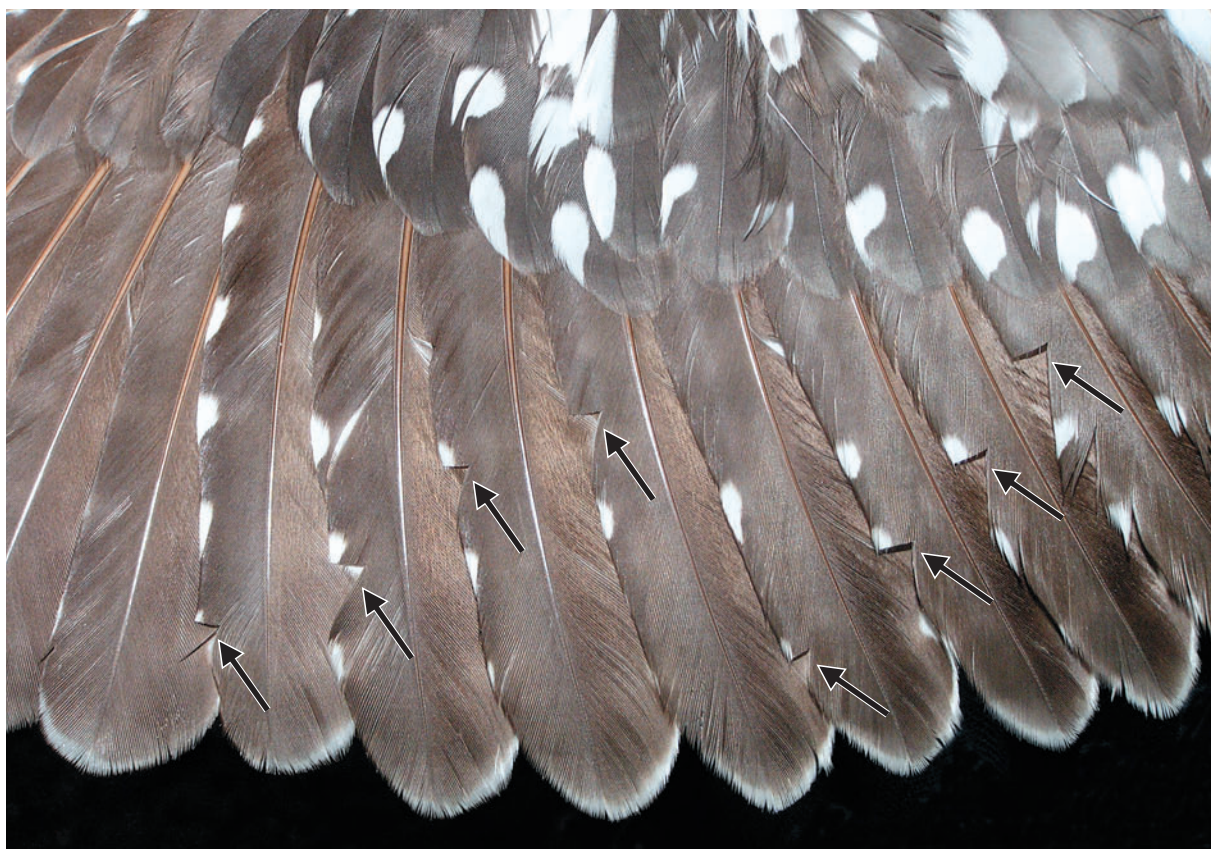
Figure 1. Photograph of open Northern Hawk Owl wing showing method of marking (indicated by the arrows) the position of secondaries in the wing during autumn moult verification.

Intensity of shedding index (ISI) describes how often and how long feathers are shed in a given period or over the whole moulting season. It is the ratio of total length of shed feathers to number of days and is expressed in mm/d. The length of shed feathers were derived from an owl feather database where average length of primaries, secondaries and rectrices was calculated on the basis of 24 feather sets (MC, unpubl. data). This index was used to investigate the effect of ambient temperature on feather shedding patterns.